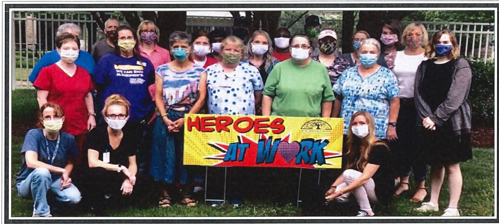
Some of our heroes at WNCBH in Asheville

“Fear thou not; for I am with thee: be not dismayed; for I am thy God: I will strengthen thee; yea, I will help thee; yea, I will uphold thee with the right hand of my righteousness”