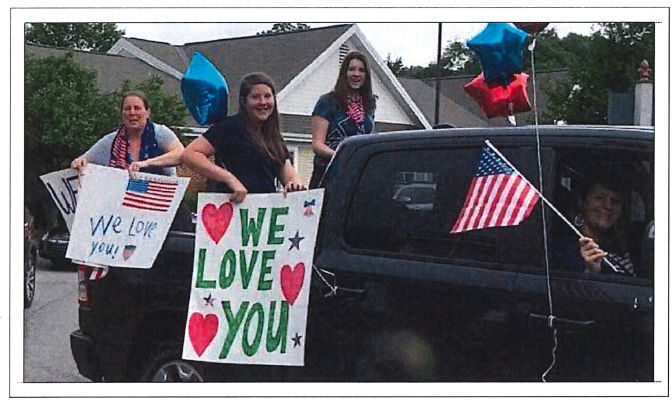
Family members parade residents at Taylor Glen during quarantine.